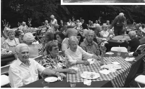
Annual Meeting Picnic